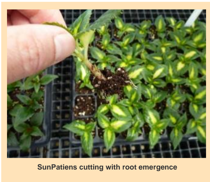
SunPatiens cutting with root emergence

When roots form, apply 75 ppm nitrogen from a well-balanced calcium nitrate-based formulation to strengthen the plants and enable them to tolerate higher light levels.