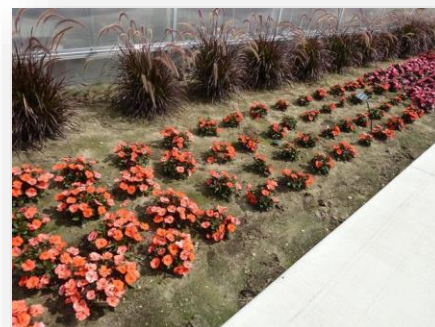
Over-regulation can severely impact the garden performance of SunPatiens

Multiple spray applications may be necessary towards the end of the crop to achieve the desired plant habit. Please note that the sensitivity of the individual varieties to the respective chemicals may vary significantly.