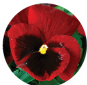
RED W/ BLOTCH