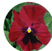
ROSE W/ BLOTCH IMP.