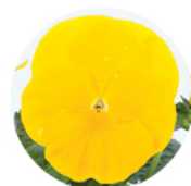
CLEAR YELLOW IMP.