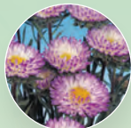
BLUE TIPPED WHITE