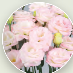
PINK FLASH II