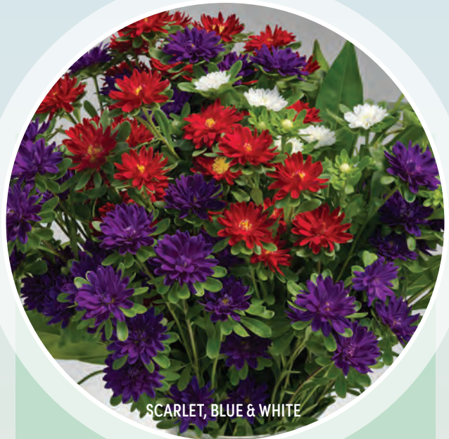
SCARLET, BLUE & WHITE