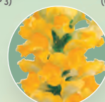
YELLOW (GROUP 2.5)