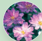
BLUE TIPPED WHITE