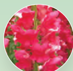
DEEP ROSE (GROUP 4)