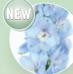
LIGHT BLUE SHADES