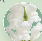
PURE WHITE (GROUP 2.5)