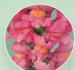
PINK (GROUP 3.5)