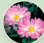
ROSE TIPPED WHITE