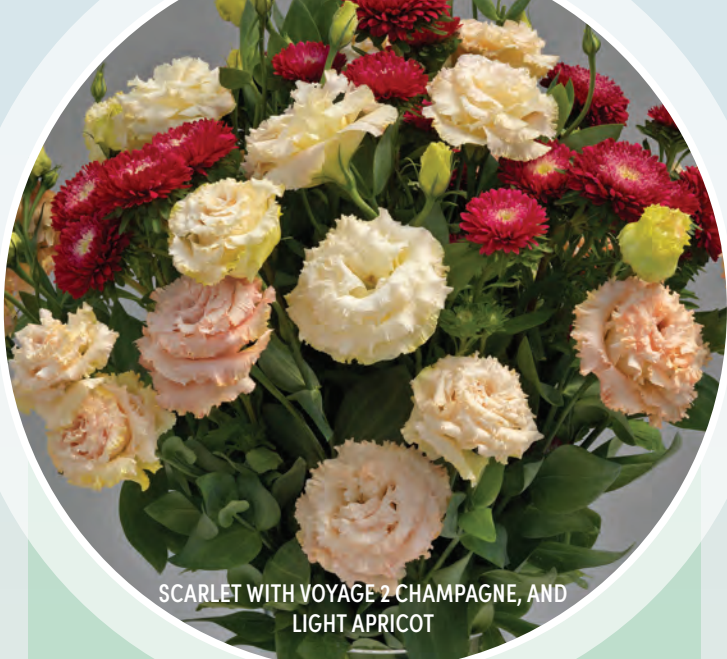
SCARLET WITH VOYAGE 2 CHAMPAGNE, AND LIGHT APRICOT