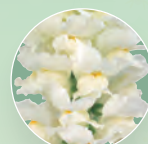
IVORY WHITE (GROUP 3)