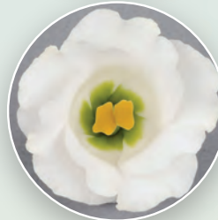
PURE WHITE II