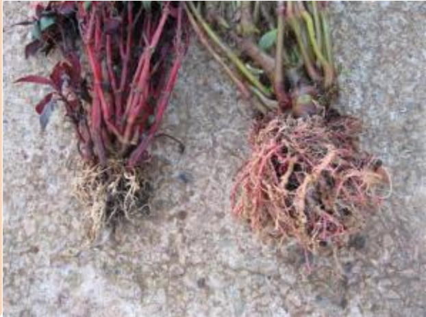
(Left) New Guinea Impatiens (Right) SunPatiens Root systems from nematode-infected soil showing how SunPatiens are better able to resist nematodes.