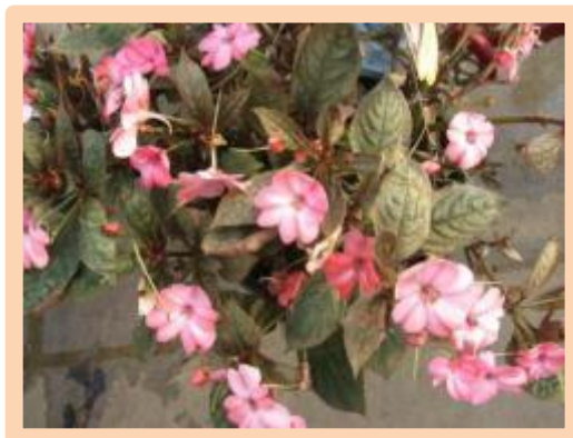
A rare sight, Spider Mite damage on a SunPatiens Hanging Basket due to insufficient watering

It is extremely important to rotate miticides or insecticide/miticides with different modes of action in order to reduce the possibility of mite populations developing resistance. Greenhouse producers should only use a material once or twice during a generation (depending on the time of year) then switch to another material with a different mode of action.