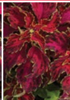
Ruby Punch NEW!