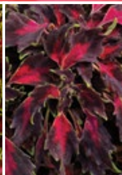
Red Bolero NEW!