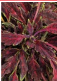
Burgundy Lancer NEW!