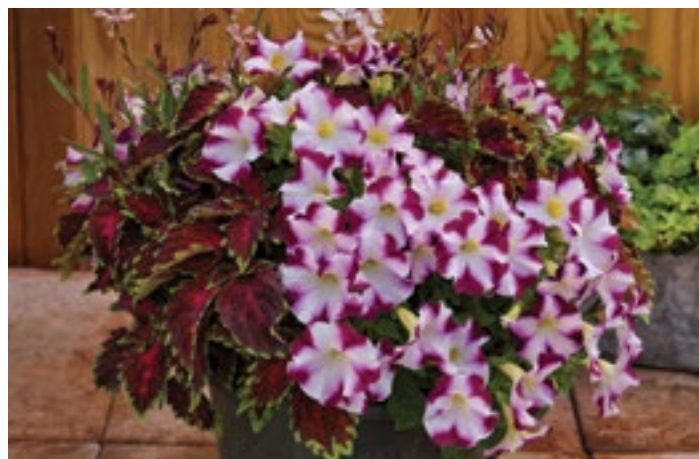
The natural compact habit of PartyTime Coleus make them ideal component plants for sun or shade combination planters.

All information given is intended for general guidance only and may have to be adjusted to meet individual needs. Cultural details are based on North America conditions and Sakata cannot be held responsible for any crop damage related to the information given herein. Application of recommended growth regulators and chemicals are subject to local and state regulations. Always follow manufacturer's label instructions. Testing a few plants prior to treating the entire crop is best.