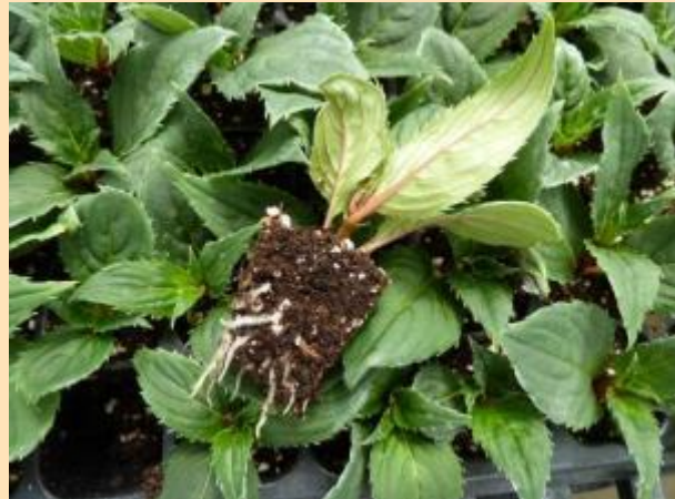
SunPatiens cutting, showing strong root development