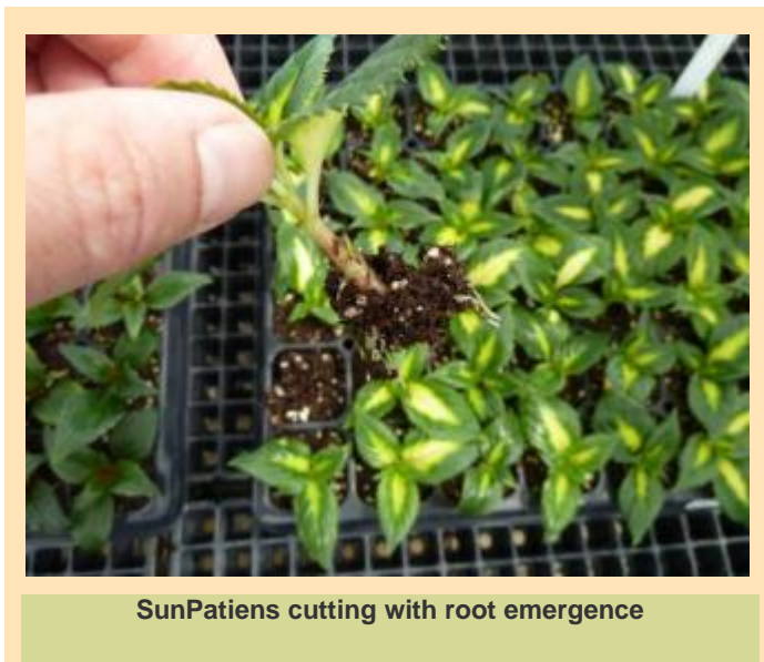
SunPatiens cutting with root emergence

When roots form, apply 75 ppm nitrogen from a well-balanced calcium nitrate-based formulation to strengthen the plants and enable them to tolerate higher light levels.