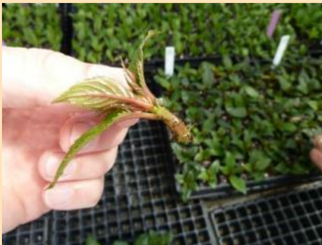
SunPatiens cutting with callus