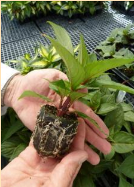
SunPatiens in 3-inch/ 70mm Fertiss Landscape Liner

SunPatiens root quickly and should be ready for transplanting in 2-3 weeks from sticking, for smaller cavity sized trays (144/128) and 3-4 weeks for large cavities (98/72). Reduce fertilizer and allow the plants to dry down between watering to tone and prepare them for transplanting. Do not delay transplanting as SunPatiens are strong growers and undesirable stretching will occur.