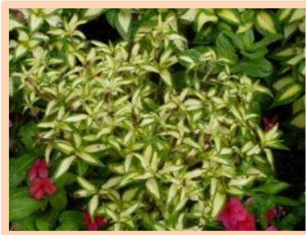
Spreading Variegated White infected with Root Knot Nematodes