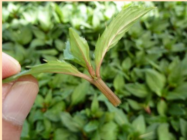
SunPatiens cutting, ready for sticking

When cuttings arrive, inspect them immediately by opening the box in a shaded sterile area to avoid exposing cuttings to insects. Cuttings can be held overnight in a cool, shady area or refrigerator at 45-50°F/7-10°C. If leaving overnight, open the box and allow the cuttings breathe and prevent moisture build up. Do not expose the cuttings to temperatures below 45°F/7°C, or higher than 60°F/16°C.