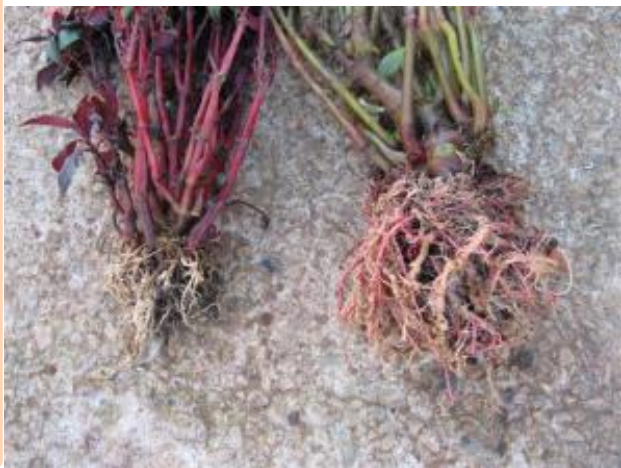
(Left) New Guinea Impatiens (Right) SunPatiens Root systems from nematode-infected soil showing how SunPatiens are better able to resist nematodes.